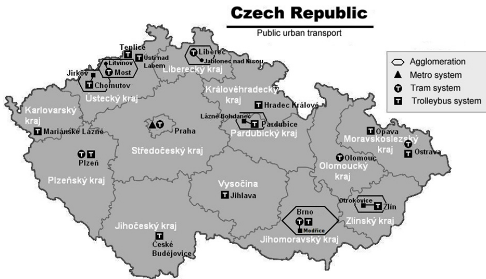
Fig. 2. Public urban transport Source: Wikimedia Commons